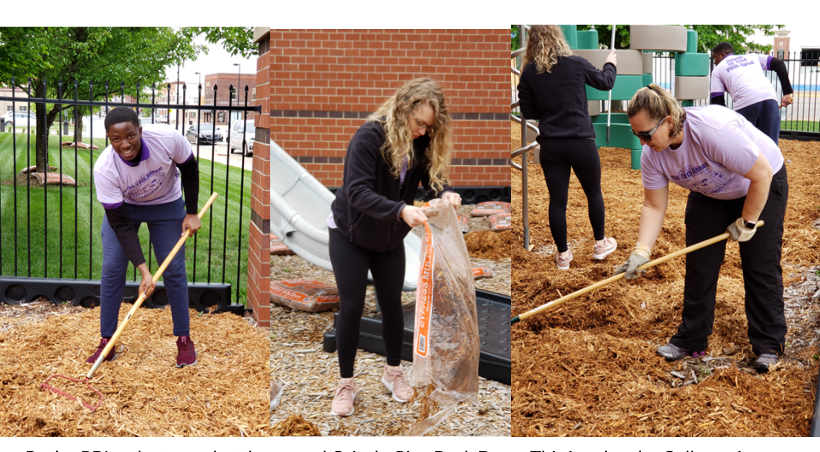
Butler PBL volunteered at the annual Grizzly Give Back Days. This is a day the College gives back to the community to thank them for all they do for Butler. The Butler PBL members and advisors worked spreading mulch in the playground and flower beds at the El Dorado YMCA.

Butler PBL took a trip to Kansas City and toured the Federal Reserve Money Museum. Pictured below are the Butler PBL members who attended (and two kids related to one of the chapter advisors).